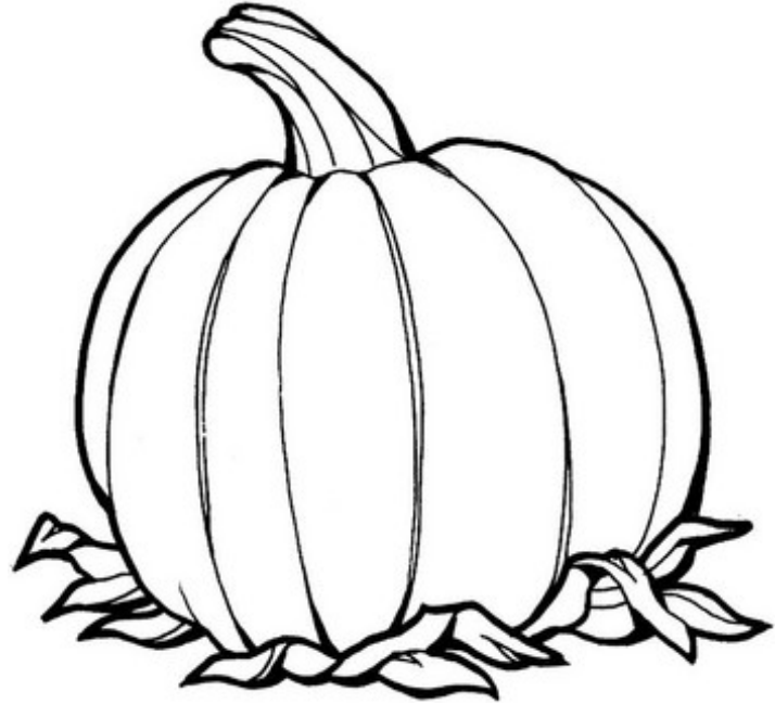
Color the picture.

How many words can you make from Happy Halloween!